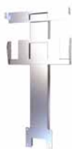
DI-050-A1, Fixed cooling stand 10 DI-050-A2, Fixed cooling stand 20 to mount on Digestor Auto, for both Tube Rack and Exhaust

The KjelROC Digestion portfolio offers something for most labs