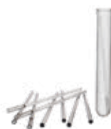
TU-222-A, Boiling Rods