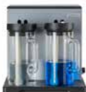
DI-110-A, KjelROC Scrubber