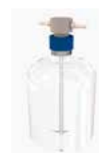
DI-111-A, Water Trap for Liquid Digestion

Our standard advanced Digestion block with motor lift. one rack and exhaust included.